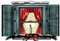
Remember Our Shut-ins